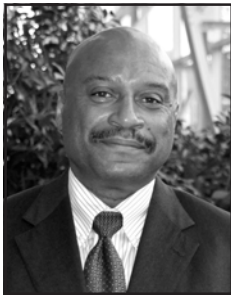
Nathaniel A. Barber Chair